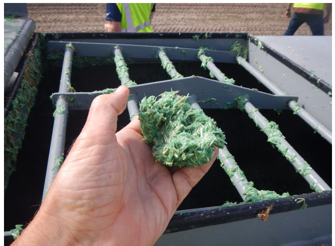
HydroStraw All In One Bonded Fiber Matrix (BFM)