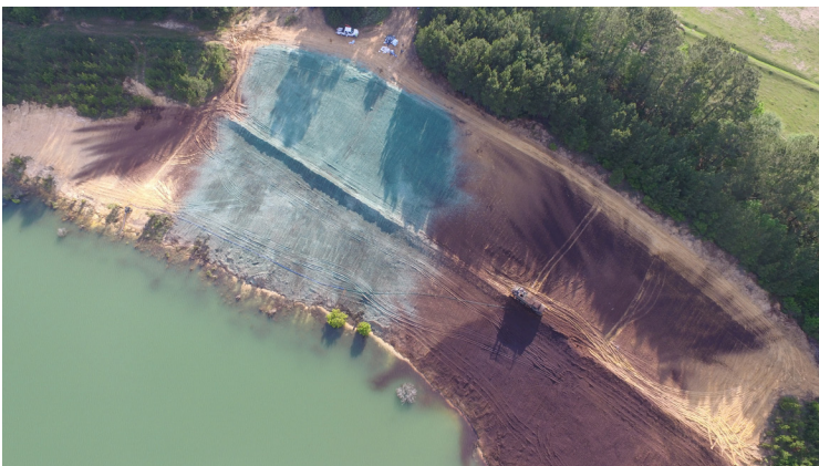
Flexterra + ProGanics Application