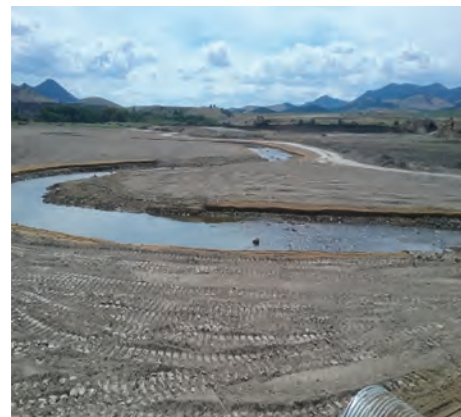
Before Biosol Forte

What's unique about Biosol? You have never seen a fertilizer like this for longevity and improving soil health! Watch our Biosol Technical Talks Webinar to learn more about this product.