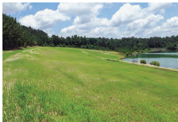
4 Months After Application