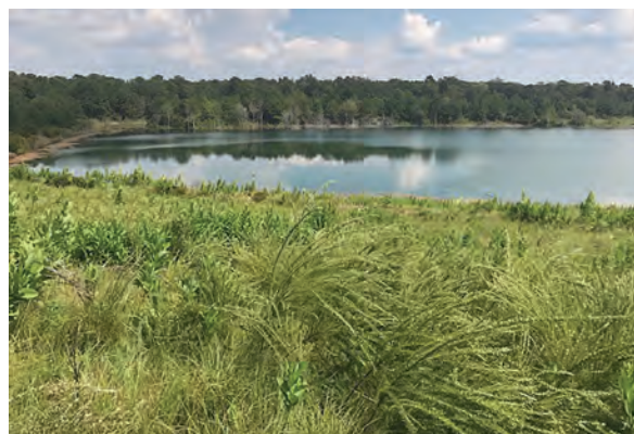
1 Year After Application