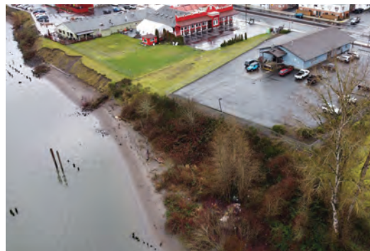
Before River Walk Installation w/ Massive Erosion

The Geoweb Soil Stabilization System prevents erosion by confining the infill material within its cellular structure (geocells), making it resistant to sheet flow and preventing scour on slope surfaces. The Geoweb system promotes vegetation growth, making it a long-term replacement for other expensive erosion solutions.