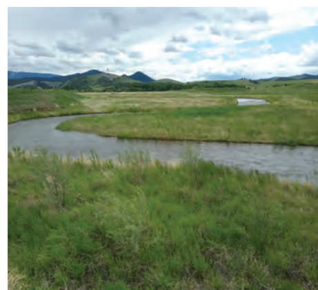
2 Years After Biosol Forte