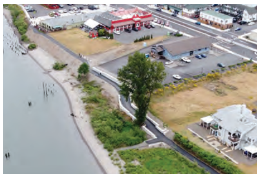
After River Walk Installation w/ Presto Geoweb Support