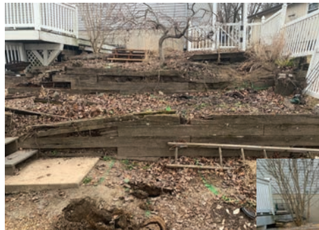
Before & After Transformation Pictures

Check out the pictures from some of our recent projects!